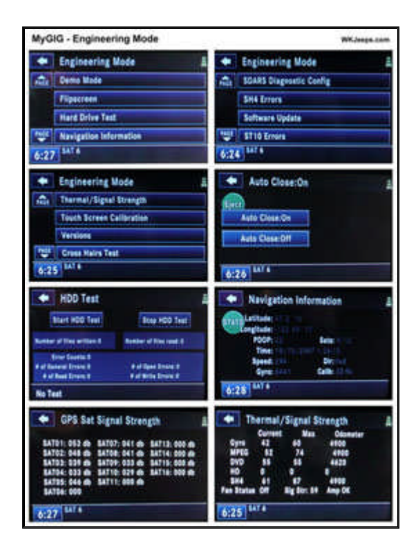
MyGIG Engineering Mode screens